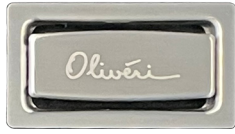
SP10-SS Natural Steel