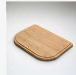
AC15 Bamboo Board