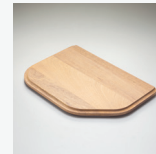
AC65 Bamboo Board