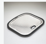
AC7320 Utility Tray