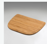
AC74 Bamboo Board