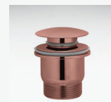
ACPUW-CU Pop-up Waste